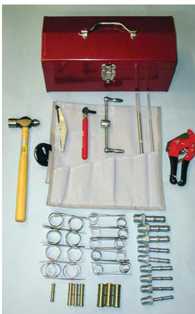
Part No. HTK-1

Be prepared to make repairs in the field or at your shop. Steel tool box loaded with fittings, band clamps and the tools you need to install band clamps and fittings on PVC spray hoses. Contents can be customized to suit your needs. Instructions included.