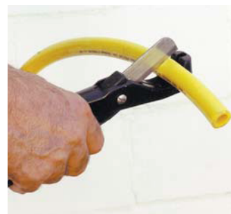
Part No. LHC95

Cuts hose and tubing up to 2" O.D. Stainless steel blade.