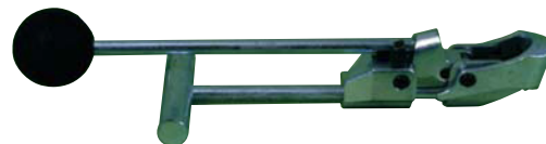
F100 Heavy-duty hand held tool for 5/8" band clamps. (Order F229 adapter for use with 3/8" clamps.)