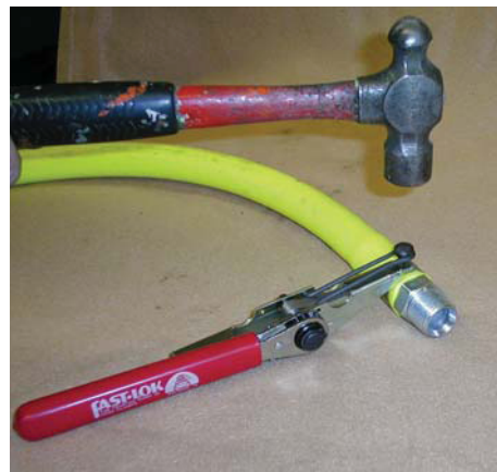
F38 Small hand held tool has two ends to install 3/8" or 5/8" clamps without an adapter. Popular choice for the tool box or shop.