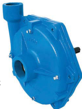
Hypro Pumps Model 9205C