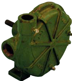
Ace Pumps Model FMCH

Original equipment on many turf and agricultural sprayers. These heavy-duty cast iron pumps are well known for their ability to efficiently handle the abrasive and corrosive chemical solutions and wettable powders normally found in herbicides, fungicides and pesticides.