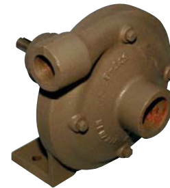
Memphis Manufacturing ECR-55

Call for assistance in choosing the correct pump for new applications or replacements.