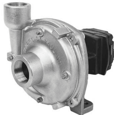
Hypro Pumps Model 9303S-HMIC