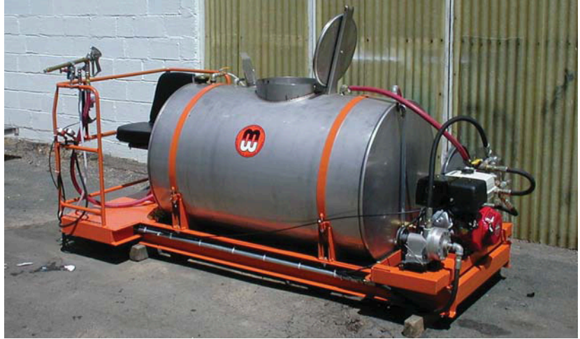
300 Gallon Invert Sprayer

Minnesota Wanner Company manufactures Invert sprayer equipment for roadside, aquatic and right-of-way applications. We can supply complete sprayers or convenient pump paks for specialized applications.