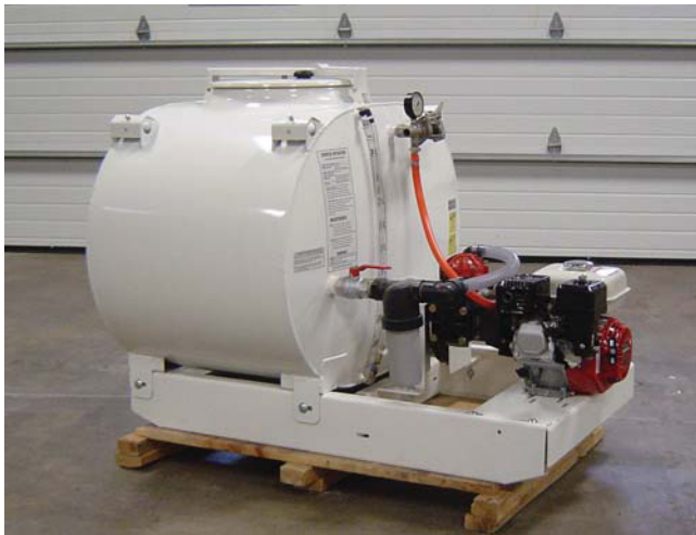
Model NF100 100 Gallon Tank 9.5 GPM

Perfect size for starting a root feeding or spraying program or as an isolated system on larger equipment to keep unwanted chemicals out of the main sprayer.