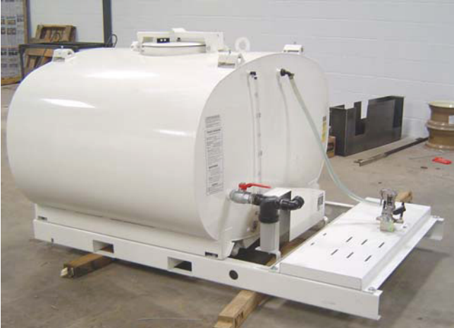
Model SK400LPE8 14 GPM Pump

Larger tank and higher output pump will handle 1 or 2 operators for root feeding or lawn fertilizing. Mechanical agitation will handle tough to dissolve fertilizers.