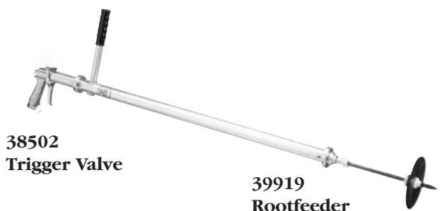
38502 Trigger Valve