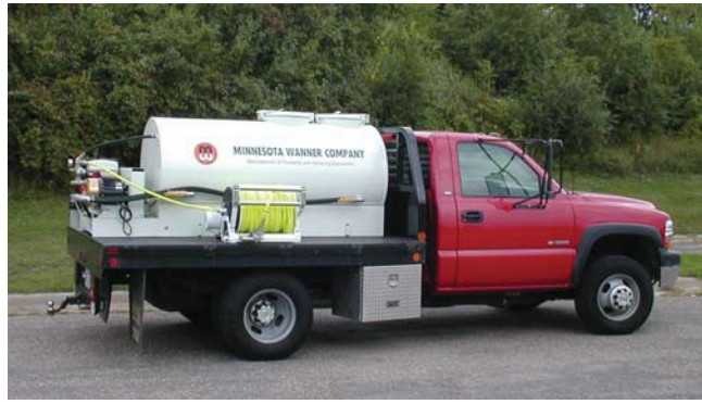
400 gallon split

We complete your unit with top of the line components like HydraCell industrial duty diaphragm pumps, Hannay hose reels, Honda and Duetz engines and stainless steel plumbing.