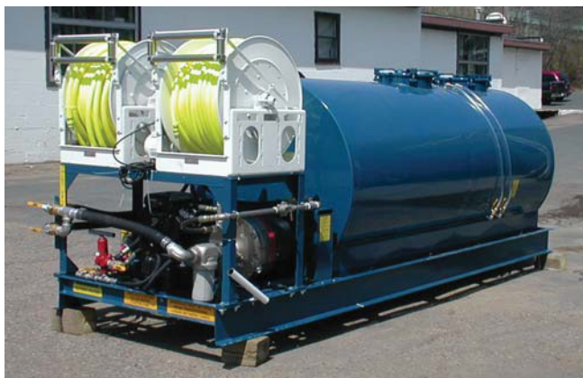
1100 gallon split

Factory direct design, build and service