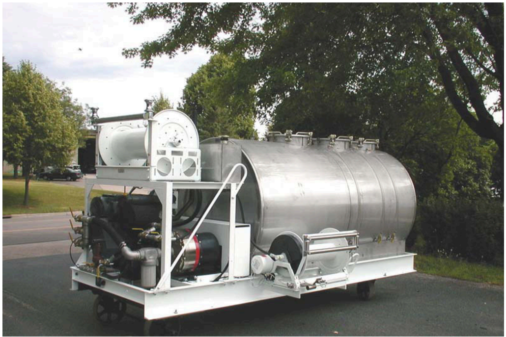
840 gallon split

For over 40 years Minnesota Wanner stainless steel sprayers have been at the top of the list of heavy duty low maintenance equipment for tree spraying, root feeding, turf and pest control.