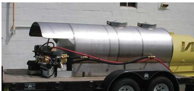
600 gallon split